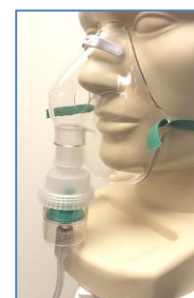
Use with Face Mask